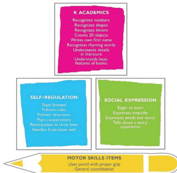
Figure 1. The Building Blocks of Readiness and Motor Skills Items

In addition to the teacher ratings on student proficiency, the study involved a survey of parents/caregivers about their child's demographics, family background, and child care experiences.